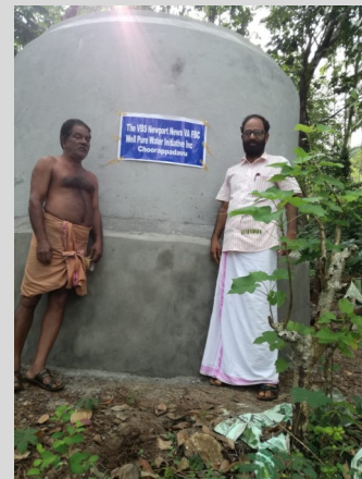
We recently received this picture of the well built in India with our 2017 Vacation Bible School offering! Thanks be to God!

Help is needed from the coast of NC to as close as Chesterfield VA and more. Will you lead an Action Team into the field? Now is the time. What will you do?